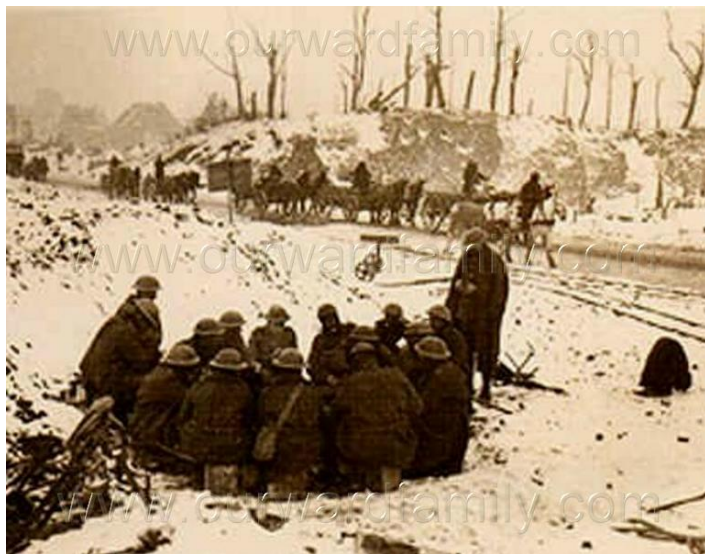
British troops at Ypres