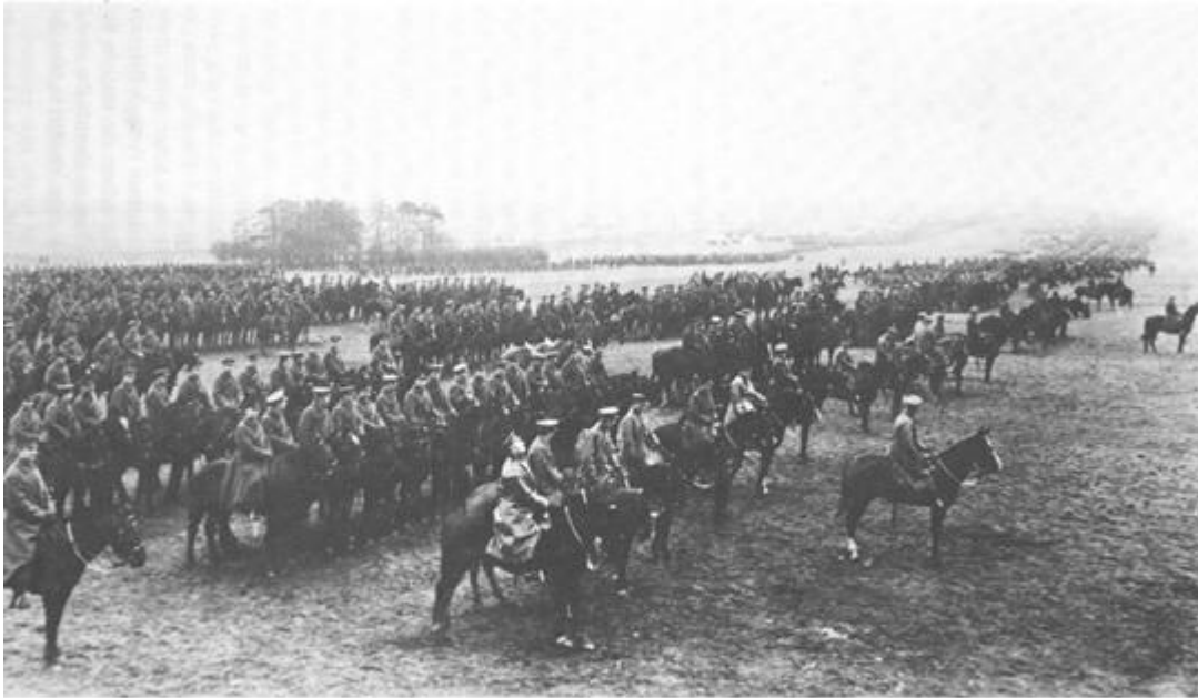
The Canadian Calvary Brigade waiting for inspection by King George V, November 1914. The RCD are in foreground.