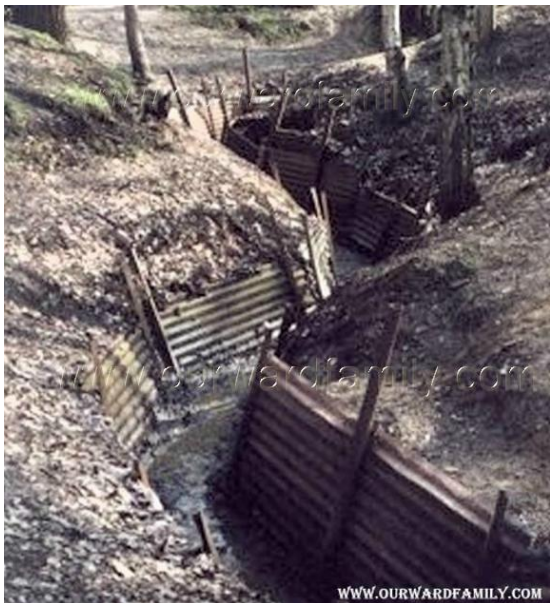
Trench at Ypres