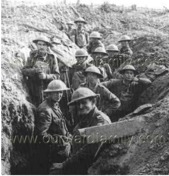
Allied troops in trenches at Ypres in 1917